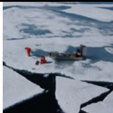
Geophysicist joins €100 million Arctic exploration project See page 12 ▶▶