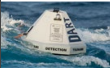
► Tsunami detection buoy

The lack of a region-wide monitoring and warning system that day undoubtedly contributed to the death toll. Since then, a network of buoys in the Indian Ocean has sent information on sea levels and seismic activity back to regional warning centres in the cities of Hyderabad, Jakarta and Perth. But how data from the system is interpreted and acted upon is vital if populations are to be warned in time.