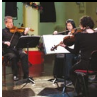
Global success for Huddersfield Contemporary Records See page 26 ▶▶

To find out more about our research and to keep up to date with the latest research news, visit: research.hud.ac.uk