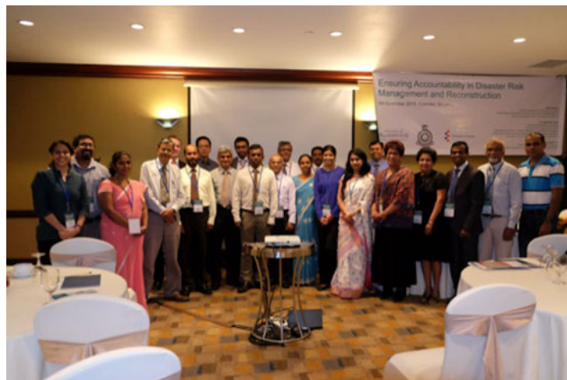
Photo: Section of the workshop participants