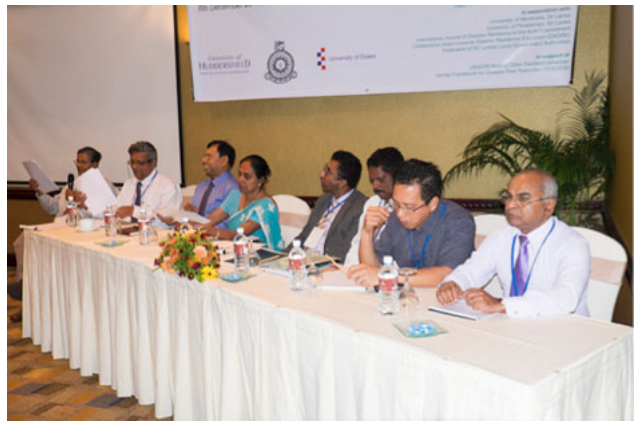
Photo: panel discussion